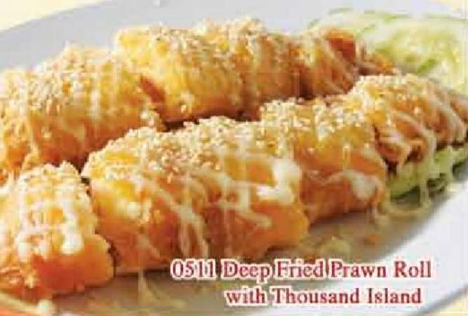
0511 Deep Fried Prawn Roll with Thousand Island