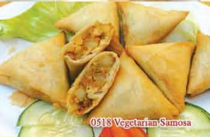
0518 Vegetarian Samosa