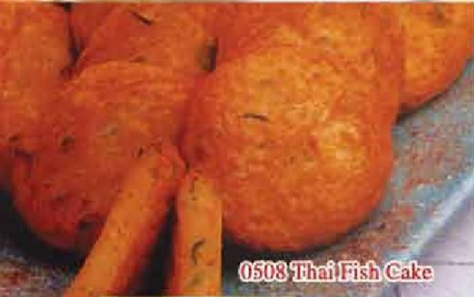
0508 Thai Fish Cake