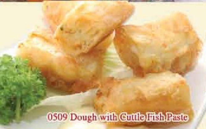
0509 Dough with Cuttle Fish Paste