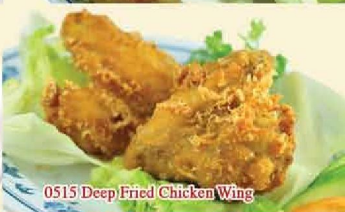
0515 Deep Fried Chicken Wing