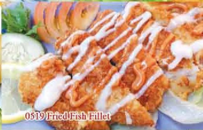
0519 Fried Fish Fillet