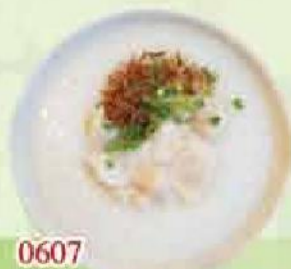
0607 Sliced Fish Porridge