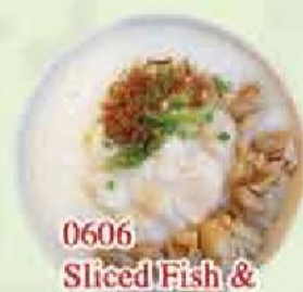
0606 Sliced Fish & Chicken Porridge