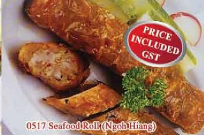
0517 Seafood Roll (Ngoh Hiang)