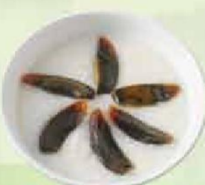
0608 Century Egg Porridge