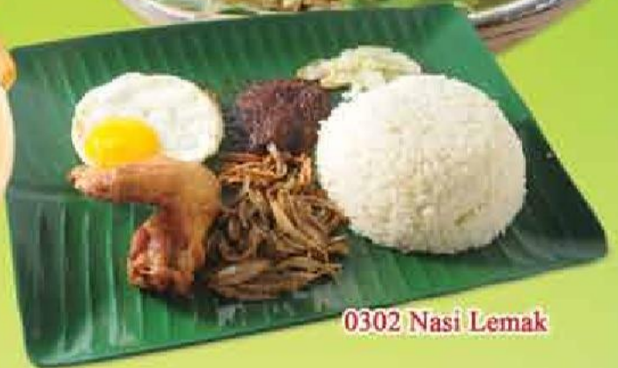
0302 Nasi Lemak