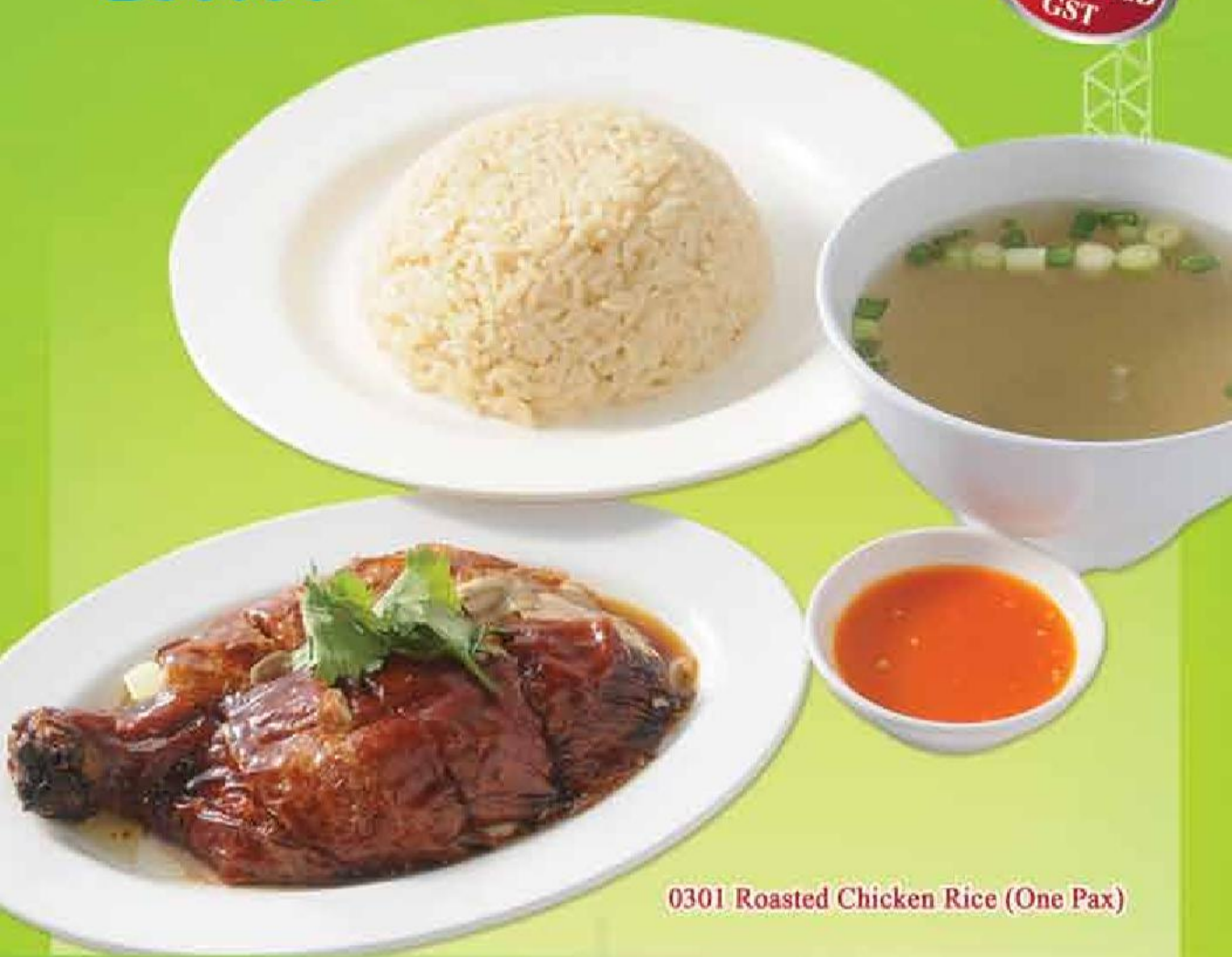
0301 Roasted Chicken Rice (One Pax)