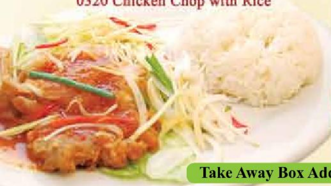
0320 Chicken Chop with Rice