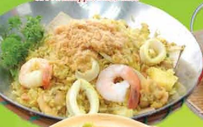
0304 Pineapple Fried Rice