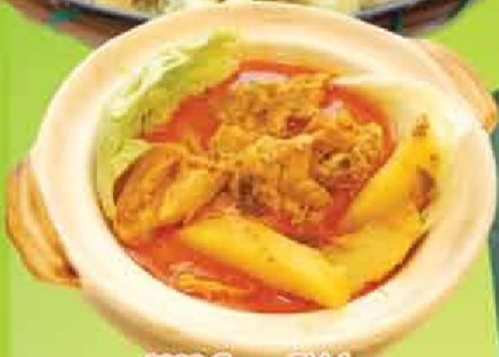
0308 Curry Chicken