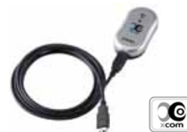
X-COM BOX module