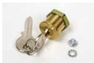
Release lock with customised key from no. 1 to no. 36

Item code 712501001 to 712501036 Price (euro)