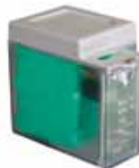
Emergency battery kit XBAT 24 (not for E 124)