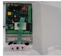
AVA-351A-Rx Box RF Receiver