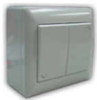
AVA-200 Spring-Loaded Wall Switch