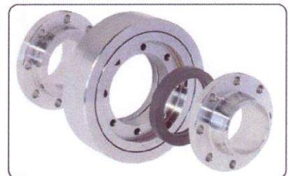
EMCO WHEATON carbon steel swivel joint with flame hardened ball race way for a long life time!

For more details see our data sheet swivel joint D2000 .