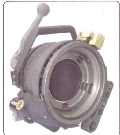
API coupler For more details see our data sheet API couplers K2 and K2P.